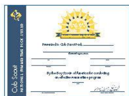
One Pack Award Certificate, No. 33731

Please send us the following National Summertime Pack Award items: