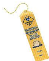
_____ Den participation ribbons, No. 616254